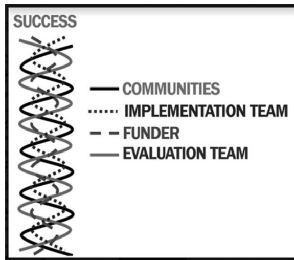
Figure 3. Quadruple helix of accountability.

magnified by the multitude of intervention components. Capturing, synthesizing, and providing feedback in rapid, short-cycles demands sustained vigilance to the intervention and stakeholders. Using a collaborative, joint accountability approach to evaluation extends the time required to conduct each evaluation stage. Recognizing, discussing, and preparing for these capacity requirements in the early stages of an initiative is recommended. We also found it helpful to simplify and automate data collection where possible (e.g., use short instruments and mobile data collection tools).